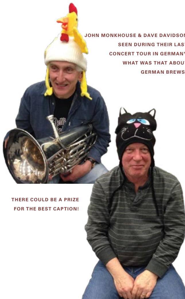
THERE COULD BE A PRIZE FOR THE BEST CAPTION!